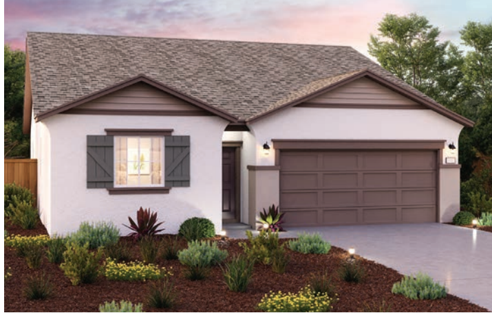
ELEVATION C - COTTAGE