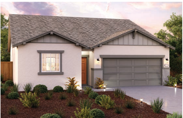
ELEVATION B - BUNGALOW