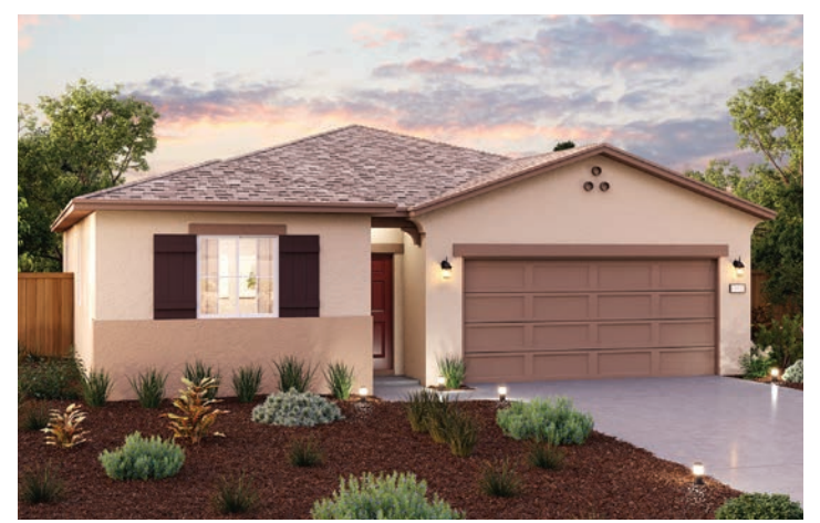
ELEVATION A - EARLY CALIFORNIA

APPROX. 1,523 SQ. FT. | 1-STORY | 3-4 BEDROOMS | 2 BATHROOMS | 2-BAY GARAGE