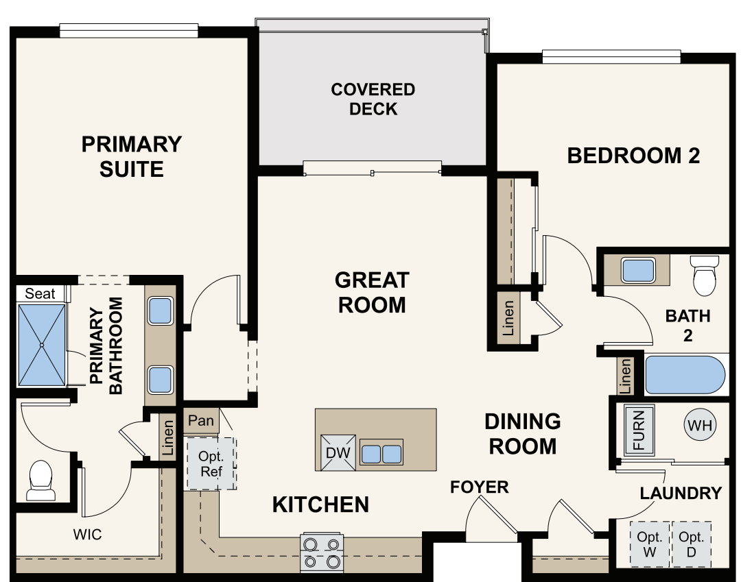
ALT. UNIT 2B