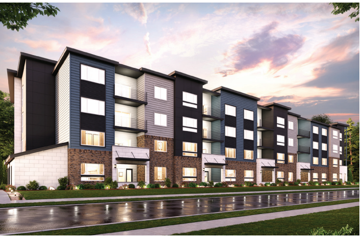
BUILDING 2 ELEVATION