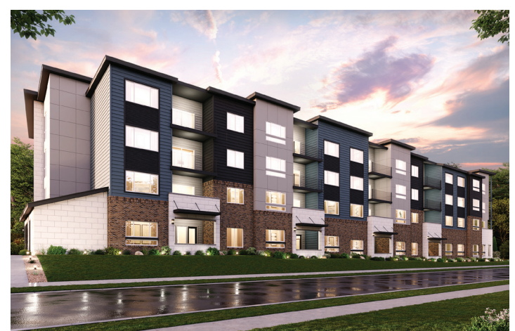
BUILDING 3 ELEVATION