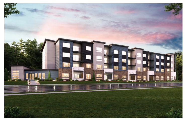
BUILDING 1 ELEVATION

APPROX. 1,203 SQ. FT. | 1-STORY | 2 BEDROOMS | 2 BATHROOMS